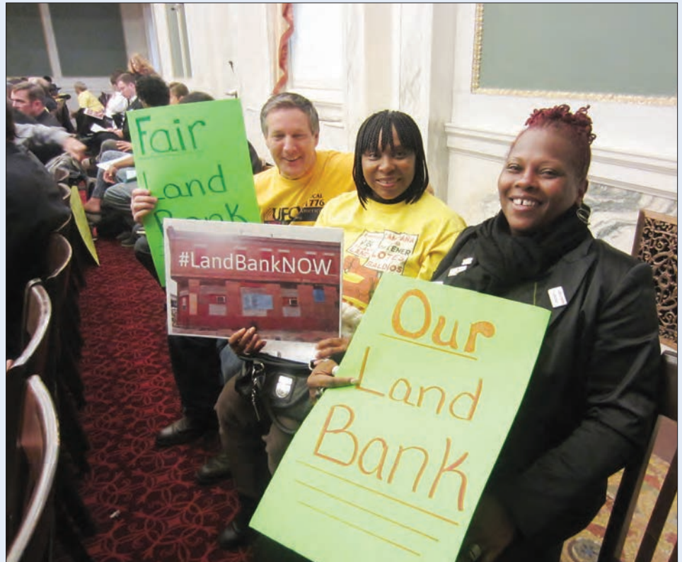
A few of the 100 Campaign to Take Back Vacant Land supporters who turned out at Philadelphia's City Hall for a successful hearing on the land bank bill.

Although the land bank is formally a subsidiary of city government, it will function as an independent entity with its own staff and board of directors, whose members include representatives of civic associations or nonprofits that work in community development or housing. The land bank is expected to be fully operational by the end of 2014. 7