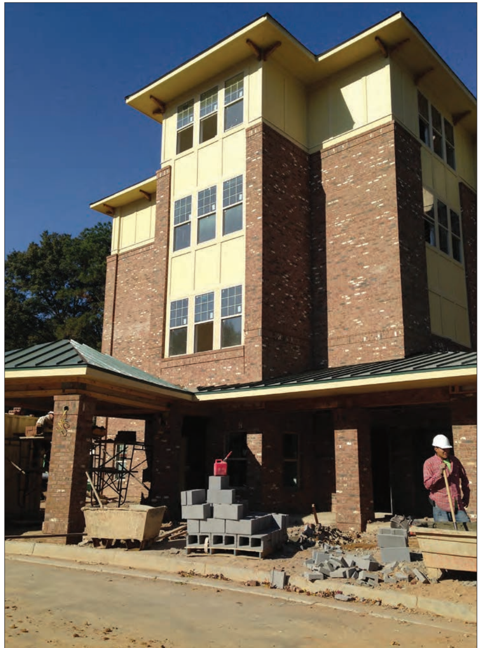
National Church Residences

county’s older industrial cities. Today, LBA addresses abandoned properties resulting from the foreclosure crisis as well as longer-term economic decline. 55 The next challenge that LBA will address is Atlanta’s citywide vacancy rate of 12.3 percent, which, according to the city’s 2013 Strategic Community Investment Report , is concentrated in only a handful of neighborhoods. 56 LBA will be better able to resolve those problems thanks to the greater agency, flexibility, and self-funding afforded by the 2012 Georgia Land Bank Act.