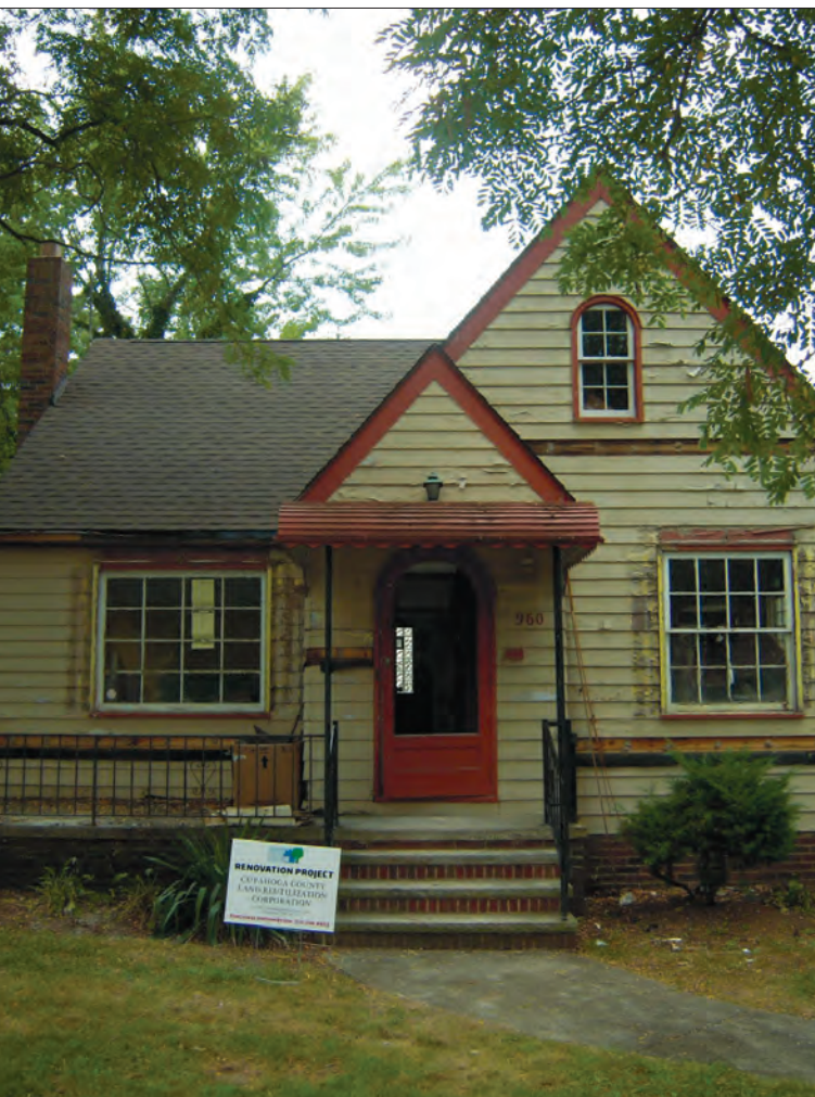
This bungalow-style home was acquired and renovated by the Cuyahoga Land Bank.