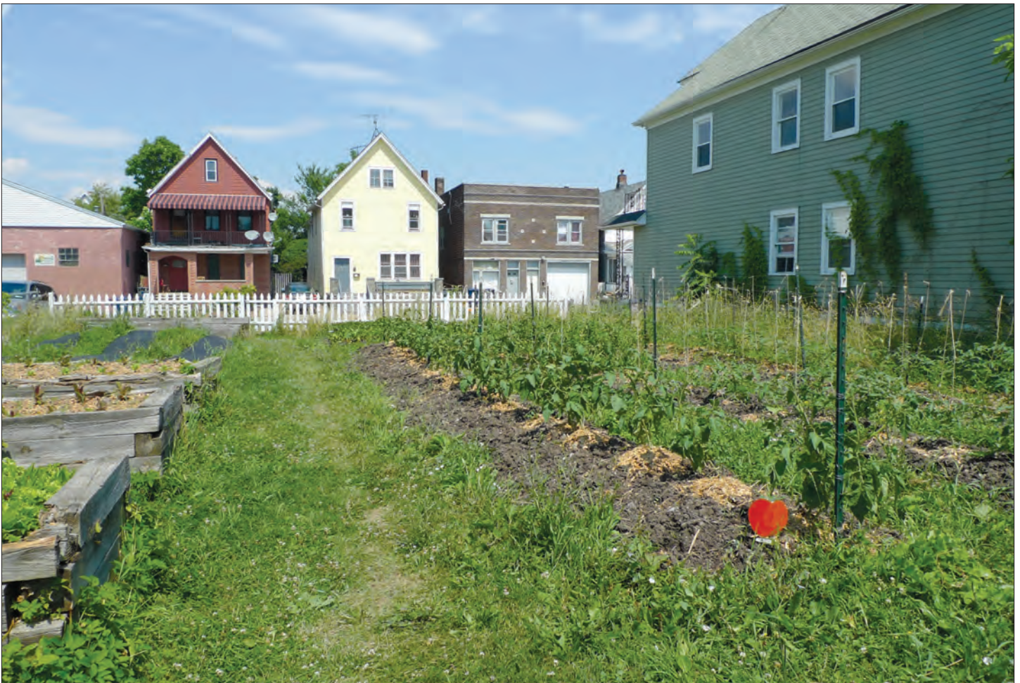
Mark Hogan AIA, LEED BD+C

Finally, a project’s viability also depends on its customers — that is, the public. A “pop-up” project must be able to offer a product that can generate enough popular appeal to a certain population — whether aimed at a broad and inclusive market, or a particular niche group — such that the temporary initiative generates enough “critical mass” to be sustainable, even if over only a short-time scale. Media outlets are an important