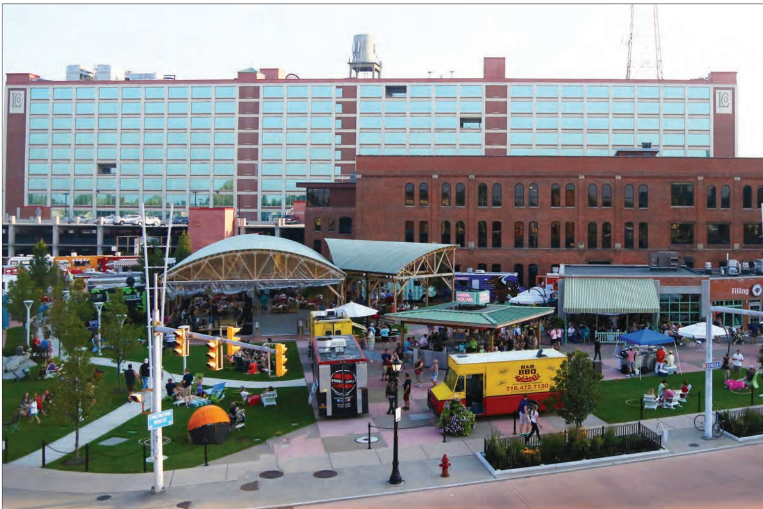
Larkin Square, in Buffalo, New York, hosts food truck events, an author series, and the “Live at Larkin” concert series, transforming a derelict industrial area into a vibrant space.

of planning strategies being adopted nationwide. 3 The recent economic crisis has left many U.S. cities, particularly those in the Rust Belt and Sun Belt, struggling with long-term economic decline, widespread foreclosures, and stalled development, resulting in an abundance of costly and unproductive vacant land. Too readily associated with