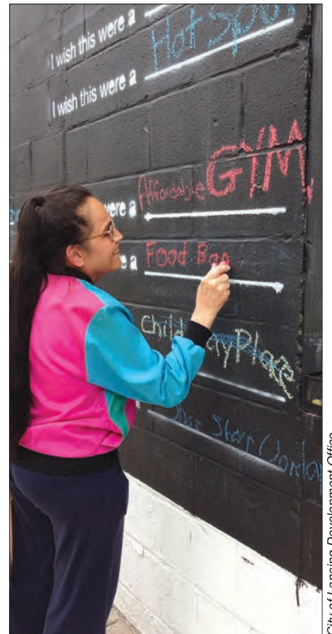
City of Lansing Development Office