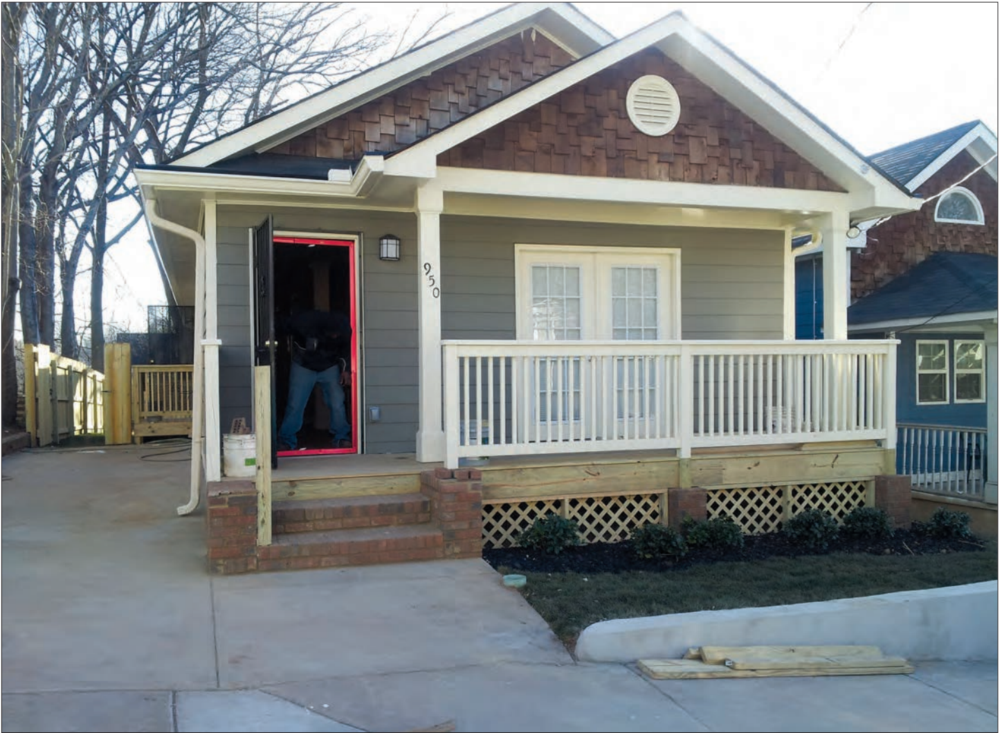
SNDSI (Sustainable Neighborhood Development Strategies Inc.)