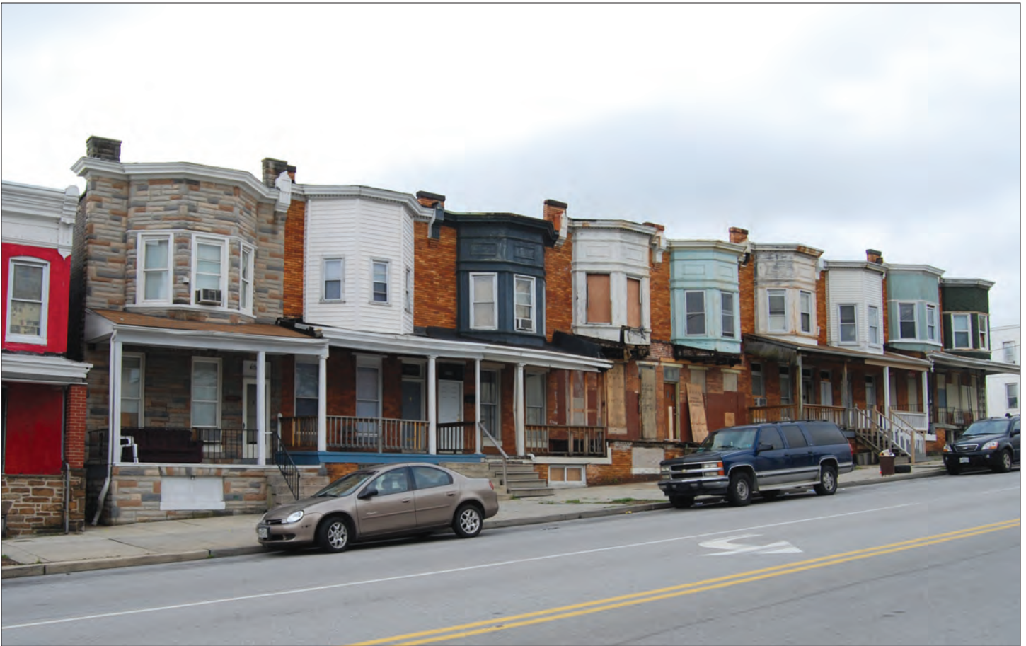
Baltimore's Vacants to Value initiative includes strategies such as whole-block redevelopment in distressed areas like this street in the city's Westport neighborhood.

analysis of Philadelphia, for example, categorized block groups as “regional choice/high value,” “steady,” “transitional,” or “distressed.” 2 In 2010, TRF argued for focusing the large infusion of Philadelphia’s Neighborhood Stabilization Program (NSP) funds on the city’s more transitional markets or on distressed markets with steadier markets surrounding them. As Ira Goldstein, president for policy solutions at TRF, writes, “NSP funds will make the most impact when invested in areas where objective and systematic data show the housing market is functioning reasonably well.” 3 This statement does not mean that larger distressed areas should not receive assistance — rather, it argues that large, one-time infusions of capital may be more effectively applied to areas where other funding sources can be better leveraged.