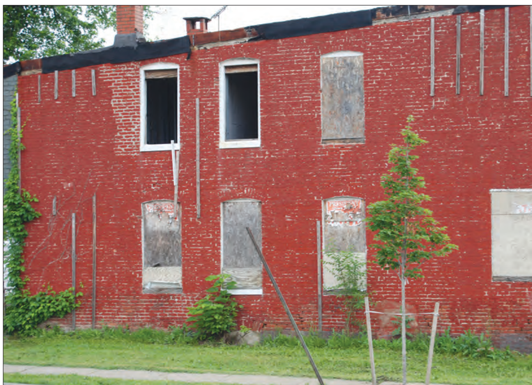
The approach to redeveloping a distressed property like the one above depends not only on the condition of the structure itself, but also on the condition of the neighborhood in which it is located.

The MVA system evaluates these indicators with cluster analysis, resulting in a neighborhood typology; a 2007–2008