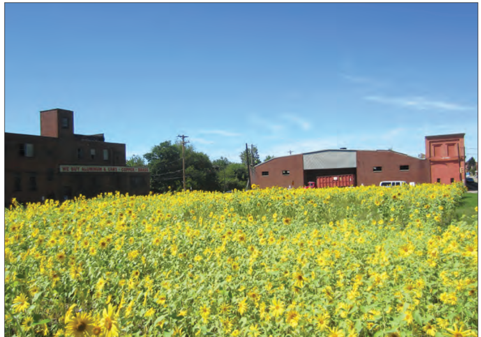
In partnership with community-based Operation Better Block's Jr. Green Corps, Pittsburgh nonprofit GTECH Strategies engaged local youth to green this vacant lot in the Homewood neighborhood.

When a local government takes ownership of a property, it typically will attempt to transfer responsibility to a new owner as quickly as possible through the sale of either tax liens