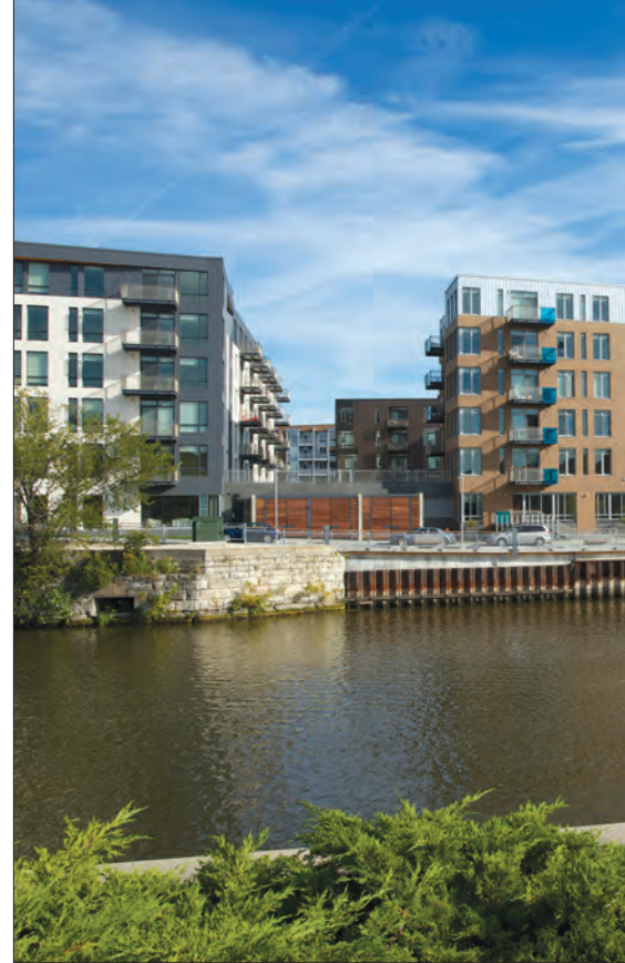
An example of successful brownfield redevelopment, the former Pfister & Vogel leather tannery (left) is now the site of The North End apartments along the Milwaukee River in downtown Milwaukee, Wisconsin (right).

may still have neighborhoods or groups of neighborhoods in which markets cannot support revitalization strategies such as scattered-site rental housing or neighborhood marketing.