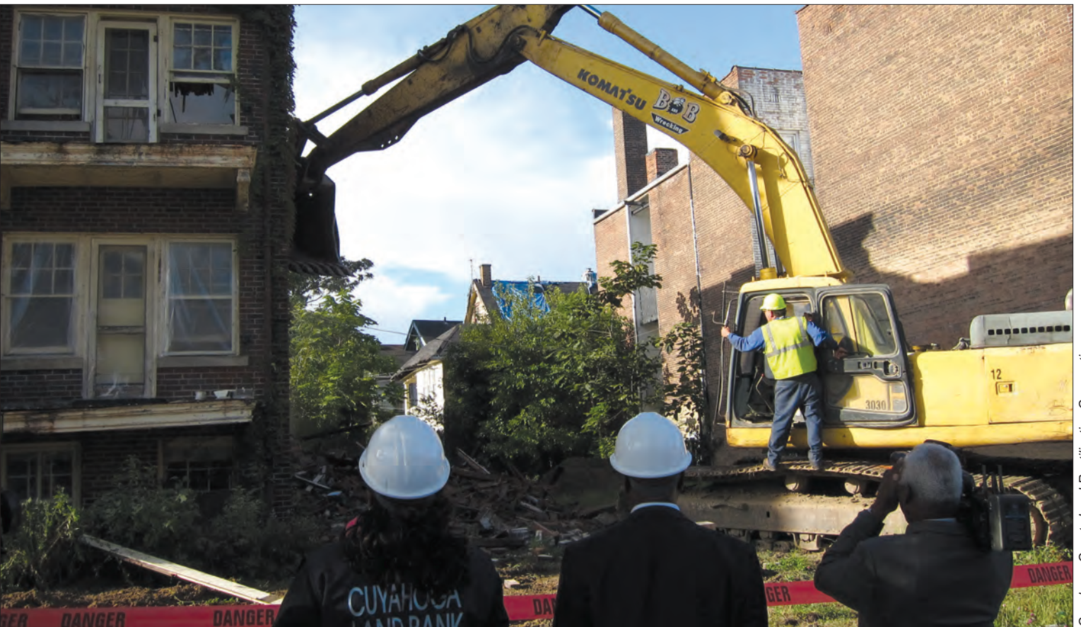
Cuyahoga County Land Reutilization Corporation

buyers with up to $10,000 in 2 percent loans for rehabilitation. 23 Through the HomeFront Veterans Home Ownership Program, a pilot program launched in November 2013 and funded with