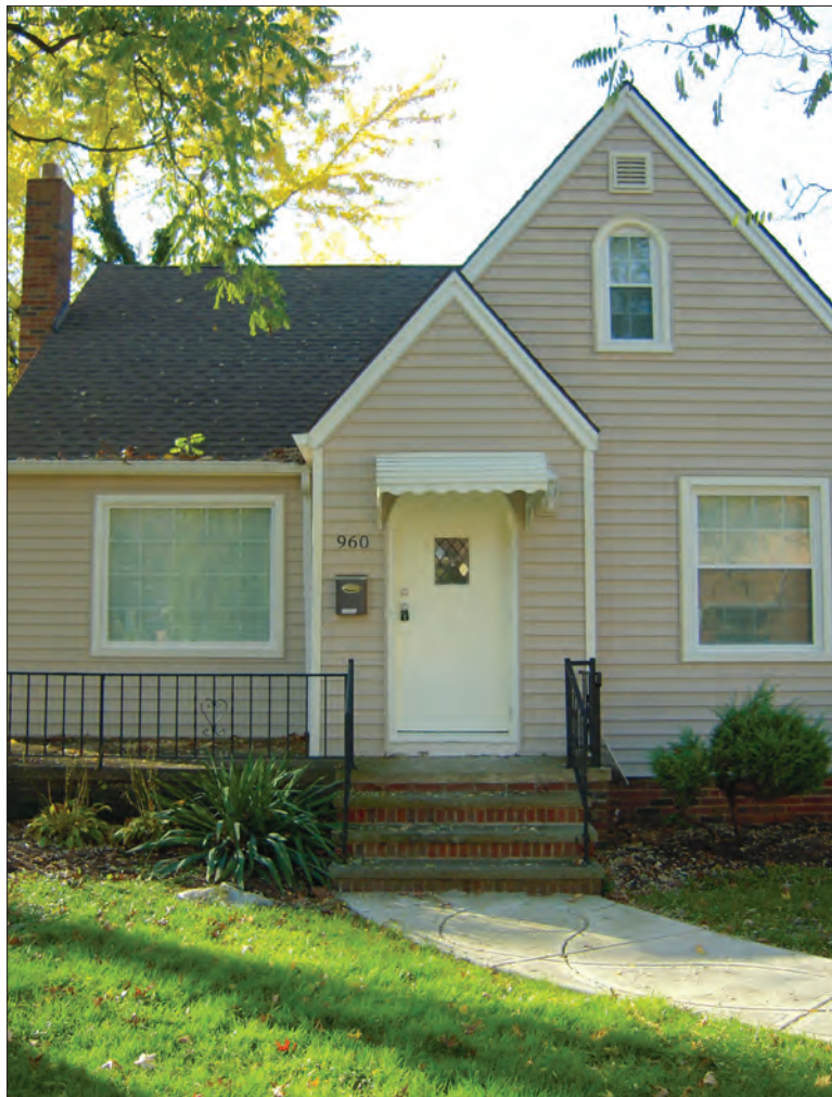
Cuyahoga County Land Reutilization Corporation

which were predatory and fraudulent.” By 2005, the number of foreclosures was so high that the Cuyahoga County Court needed an average of two years, and up to four or five, to resolve foreclosure cases. 15 Foreclosures in the county peaked at more than 14,000 in 2007; since then, the number of foreclosures, although still high, has begun to decline, reaching 11,427 in 2012. 16 The foreclosure crisis has hit low- and middle-income neighborhoods especially hard; 48.8 percent of foreclosures in 2007 took place in 15 of Cuyahoga County’s 95 neighborhoods. Although the pace of foreclosures has slackened, the area is still coping with the aftermath of years of staggering foreclosure rates. 17