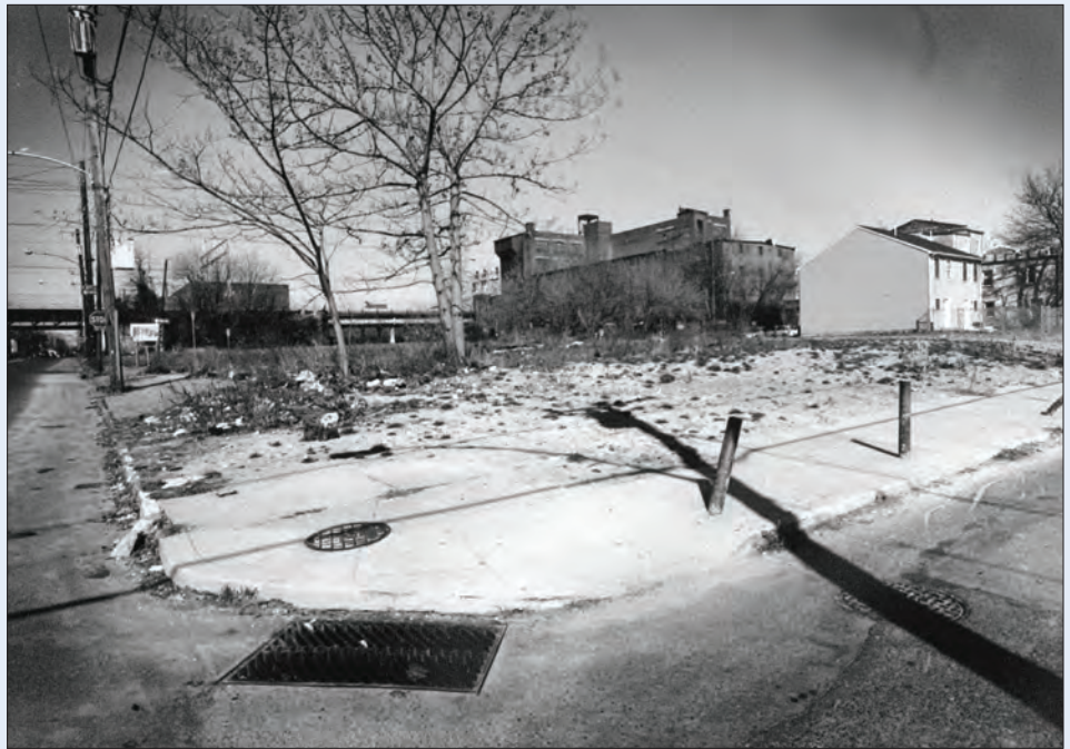
A vacant lot in North Philadelphia.

Local governments, nonprofits, and residents combat vacancy and abandonment with limited and often dwindling resources. The areas hardest hit by the high costs of vacancy and abandonment tend to be those struggling most with economic decline and falling public revenues. Federal programs and policies offer important aid to municipalities facing the challenges posed by foreclosed and vacant properties, including longstanding programs such as HUD's Community Development Block Grant and HOME Investment Partnerships programs. Both of these programs offer localities considerable flexibility in how they allocate funding; they can be used, for example, to fund the purchase and rehabilitation of vacant homes. 1