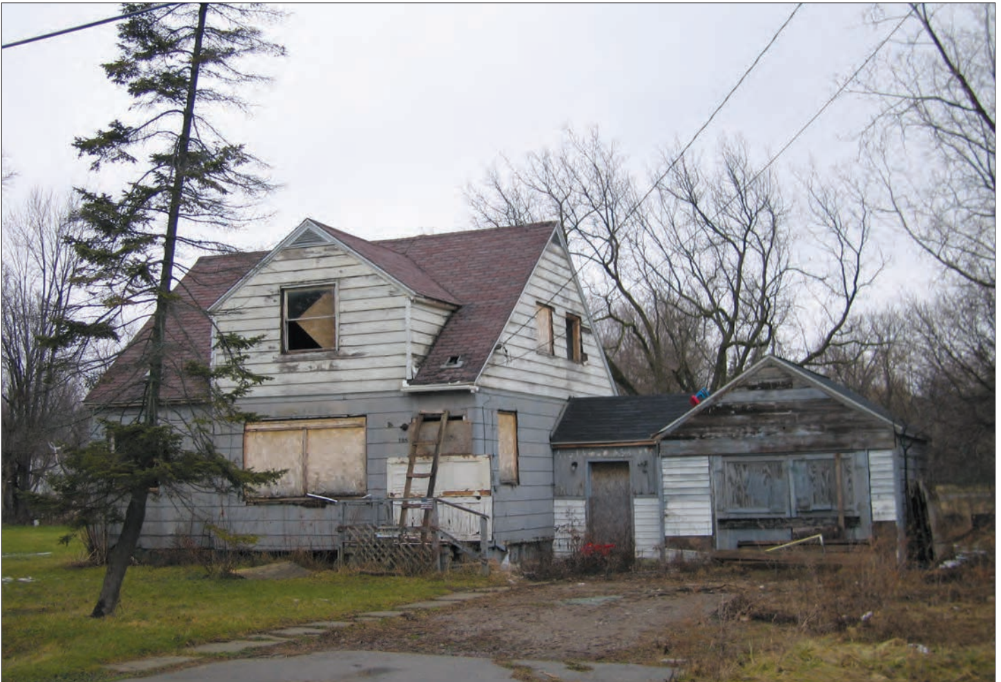
The Genesee County Land Bank Authority works to ensure productive reuse of tax-foreclosed properties in the city of Flint and Genesee County, Michigan.