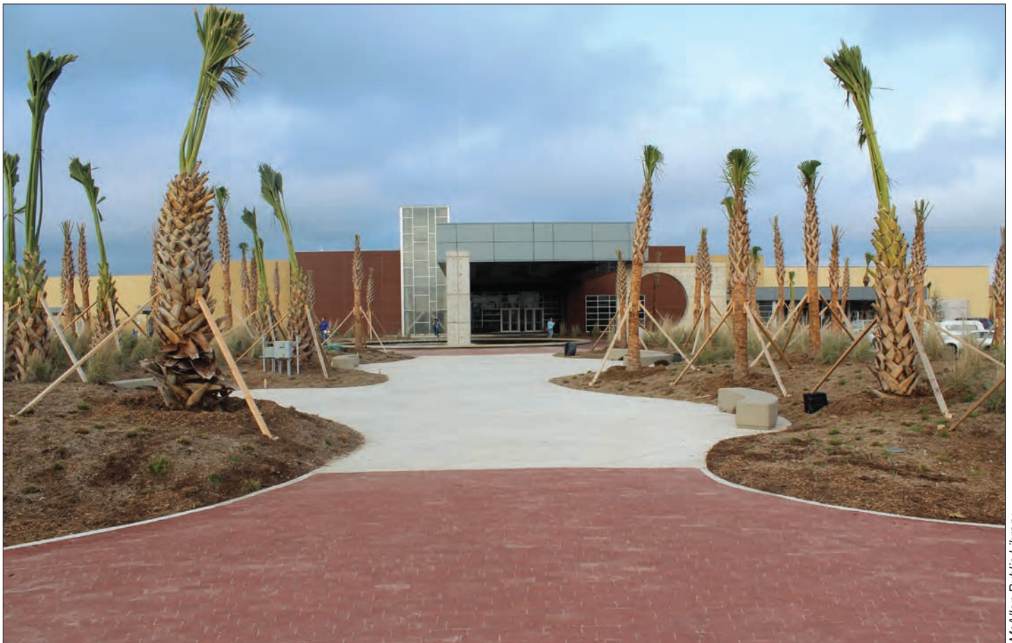
McAllen Public Library