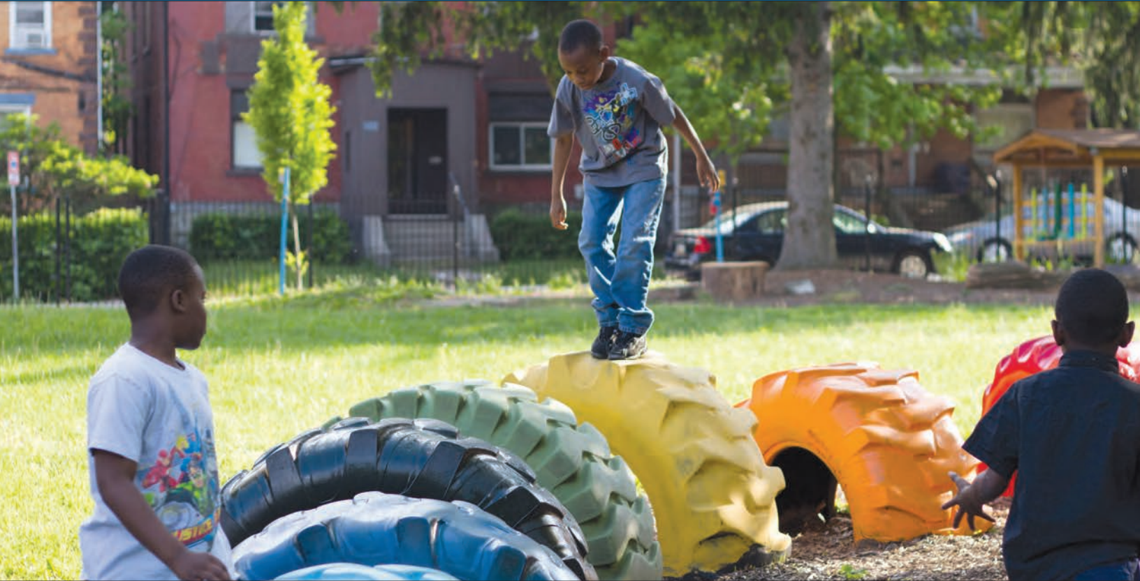
Vacant lots can be greened and repurposed for new uses, such as this play area in Pittsburgh's East Liberty neighborhood.