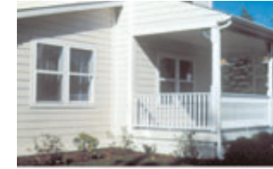
Site-built porches lend scale to factory-built homes.