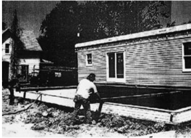
Modular home is slid on steel beams onto foundation (courtesy, Venture, Inc.).

the wheel wells and the 2-inch-deep steel shackles interrupt an otherwise flat basement ceiling after the home has been set.