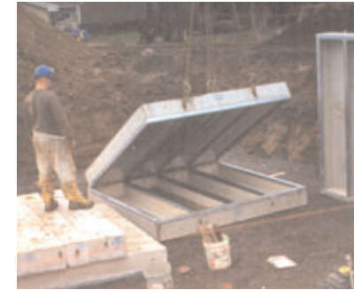
Precast concrete foundation systems.

Modular units are usually placed on foundations that are either crawlspaces or full basements. The developer's contractor is typically responsible for excavation, construction of the foundation, and