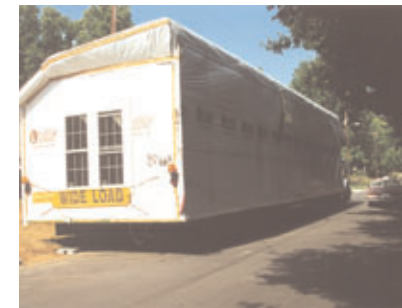
Keep neighbors informed on when house will be delivered (courtesy, MHI).