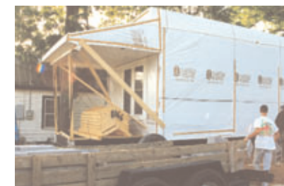
Manufactured home section installed on foundation (courtesy, MHI).

More expensive floor systems have been devised to allow basement stair openings to be placed anywhere. The best known of these is the Lindsay floor system, used by several manufacturers. The heavy Lindsay system is as deep or deeper than a typical system, and is patented. Only