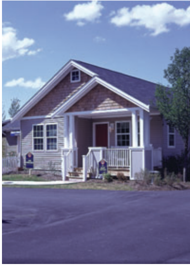
Developers should show examples of factory-built homes that fit with the neighborhood.

building officials and zoning boards unfamiliar with and skeptical about factory-built housing.