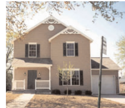
Modular homes are available in a wide array of floor plans and styles (courtesy, Unibilt Industries, Inc.).

Since modular home manufacturers often compete directly with site builders they're apt to offer a wider range of floor plans, upgrades, and combinations and allow for more customization. There is a wide spectrum of modular home manufacturers who deal in anything from low-end no-frills models to multi-million dollar mansions. The modular companies that will probably appeal most to nonprofit groups will likely fall somewhere in between. Here are some points to consider: Because urban sites are generally small and narrow as they face the street, two-story or even three-