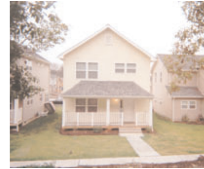
Well-designed factory-built homes can be sympathetic with existing housing.