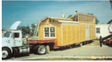
Wide-load delivery vehicles must have unencumbered access to the site.