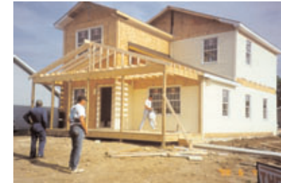
Site-built elements are the responsibility of the developer’s contractor.

If the contractor is unfamiliar with manufactured or modular housing, help him or her get up to speed. Bring the contractor in from the beginning of the project during the ordering of the home and formulating a plan to manage the site and foundation work. Have the contractor learn as much as possible about the factory-built house he or she will be working with by having a briefing with a manufacturer’s representative and by sending the contractor on a factory tour.