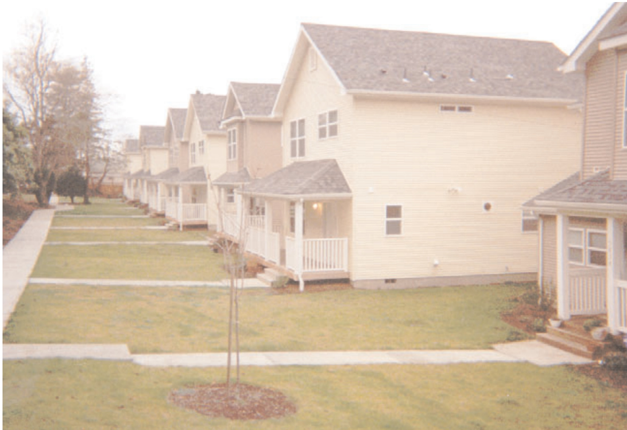
New models of manufactured homes are particularly suitable for infill sites in traditional neighborhoods.

Houses in a manufactured home plant generally move through the production line quickly with no room for modifications during production. Manufacturers who offer a variety of plans and options and who are willing to make some “custom” adjustments will likely be the ones who can best serve nonprofit developers in urban areas, but these adjustments must be completed and held firm well before production time, as they are included in production documents and “locked in” with enough lead time for ordering of special parts and materials.