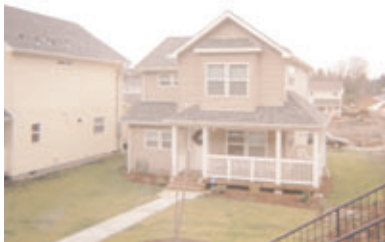
Factory-built homes that look site-built retain their value.