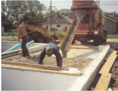
Foundations are generally the responsibility of the developer's contractor.

The length of time between ordering the house and its delivery and set up can be very short compared to site-built construction (which can run from three to six months). So it is imperative to be sure everything proceeds like clockwork and that all the trades are lined up to appear when they're needed.