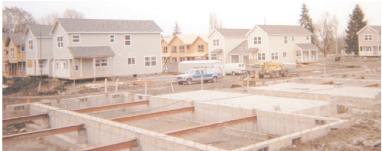
Permanent foundations for manufactured homes.

The foundation for a manufactured home can be similar to the foundation used for a modular home. In rural areas, manufactured homes are often placed on block pier foundations, which are not considered permanent. On urban infill lots, this technique WILL NOT BE ACCEPTED and should not be used. Rather, permanent poured concrete or block foundations should be used. Permanent foundations are recommended for other reasons. First, eventual owners can qualify for a conventional mortgage loan, homeowner’s insurance, and FEMA flood insurance. Wind and seismic