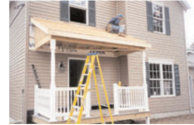
Finishing crew constructs site-built elements such as porches.

Modular homes generally must meet the same code requirements as site-built homes. In most cases they are built according to a state-wide or locally amended code. Plans have to first be inspected and approved by the state or its agents. During production, licensed third-party inspectors and occasional state-sponsored inspectors will check the modules during all phases of construction and put an approval seal on each module before it leaves the plant. Installation, finish work, utility connections, and any site-built elements fall under the local code jurisdiction and local building department procedures. There can be misunderstandings, conflicts, and delays if the local inspector and developer disagree about who has code jurisdiction over what. It is best to discuss and resolve all issues with the local inspector long before the factory-built sections arrive on the site.