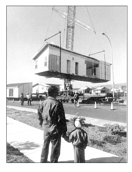
Figure 2.1: Manufactured housing is transferred to the construction site and lowered onto its foundation

Panelized housing consists of factory-built housing components, transported to the site, assembled and secured to a permanent foundation. These houses are subject to the local building codes of the site where the house will be assembled. These panels consist of open-wall, closed-wall, and structurally insulated panels. Open-wall panels are traditional 2x stud framing at 16- or 24-inch spacing nailed to top and bottom plates. These interior and/or exterior wall panels are cut and assembled in a plant, then shipped to the site for field assembly in the conventional, platform-framing manner. Closed-wall panels are similar to open-wall panels except that