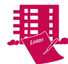
Table 17. FHA Unassisted Multifamily Mortgage Insurance Activity: 1980–Present*