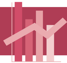
Table 12. Market Absorption of New Rental Units and Median Asking Rent: 1970–Present*