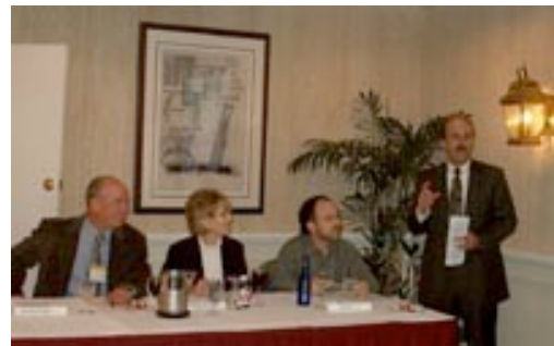
Roundtable participants discuss education as a barrier to innovation.