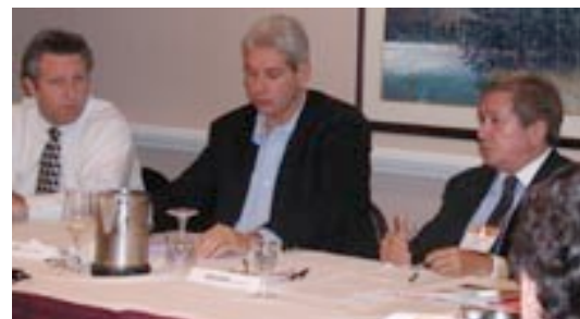
Panel members representing suppliers and architects discuss preferences as barriers.