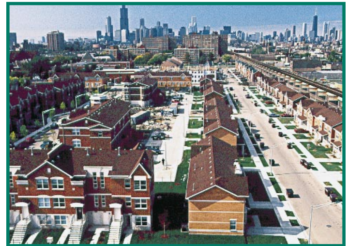
From highrise to human scale, Henry Horner Homes, Chicago

U.S. Department of Housing and Urban Development Office of Public Housing Investments 451 Seventh Street SW Washington, DC 20410