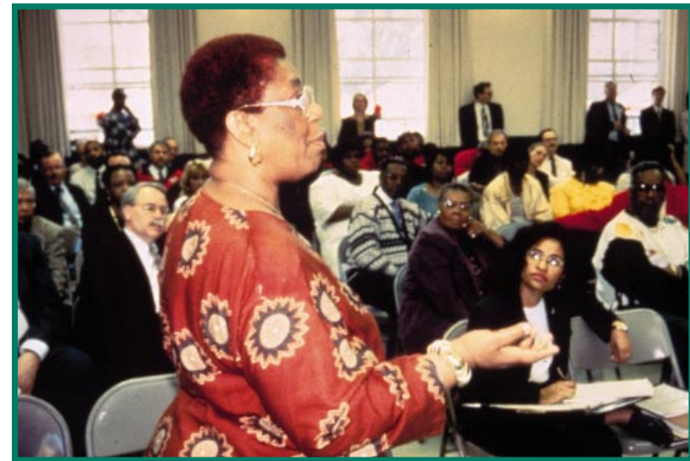
Residents participate in planning the revitalization of HOPE VI neighborhoods

ditional communities—front porches, wide front steps, sidewalks, neighborhood pools, and playgrounds—that encourage residents to know one another and take an active interest in their neighborhood. 🏠