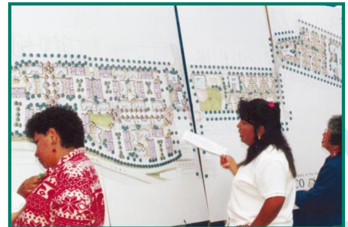
Public housing residents examine HOPE VI site plan

It was President Bill Clinton’s Urban Empowerment Agenda that