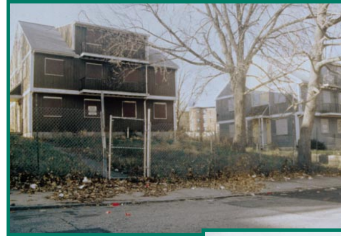
HOPE VI infill helped renew Pittsburgh’s historic Manchester neighborhood

An architectural critic once described the dominant style of American public housing as “penal-colony modern.” The term is tragically apt. The spartan high-rises and barracks-style buildings of many projects were institutional—even punitive—in both form and function. Some lack basic features such as closets; others