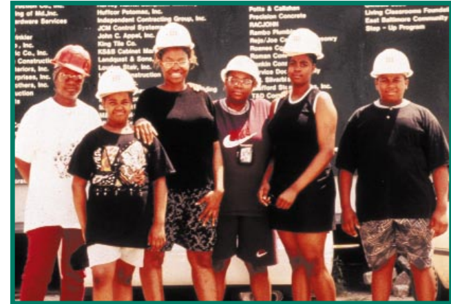
Youth apprenticeships give residents constructive alternatives to the streets

For many public housing families, however, these advantages alone will not enable them to overcome the serious obstacles ahead. HOPE VI allows housing authorities to devote up to 15 percent of their grants to delivering a wide range of community and supportive services that will equip these residents with the skills they need to succeed in the workforce—and in life. Institutional partners in HOPE VI initiatives—community- and faith-based nonprofit groups and state and local social service agencies, in particular—usually take a leading role in providing these services, which include: