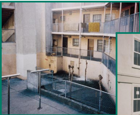
Hayes Valley public housing before and after HOPE VI, San Francisco

With HOPE VI grants, housing authorities have the necessary resources to fix these mistakes by tearing the properties down and starting over again or, in some cases, rehabilitating them.