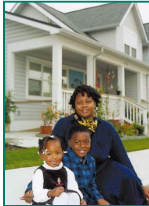
Families at Seattle’s NewHolly take pride in their HOPE VI homes

of last resort. Housing authorities today are moving aggressively to ensure that public housing residents relocating from HOPE VI sites during the redevelopment process are able to choose homes and the