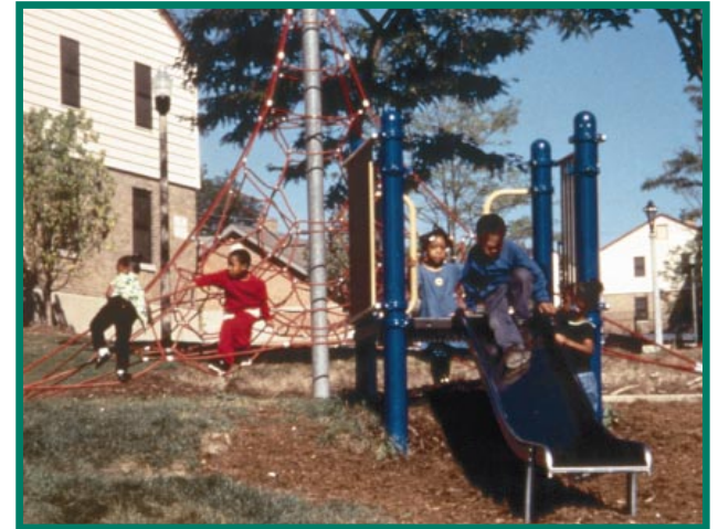
Hillside Terrace in Milwaukee was designed with kids in mind

authorities have established rigorous admission requirements for HOPE VI communities. For example, the housing authority may require that public housing residents be in a self-sufficiency program that sets clear goals for moving toward independence. Like any private landlord, most housing authorities demand that residents do not have a recent history of abusing their lease, their credit, or the law. 🏠