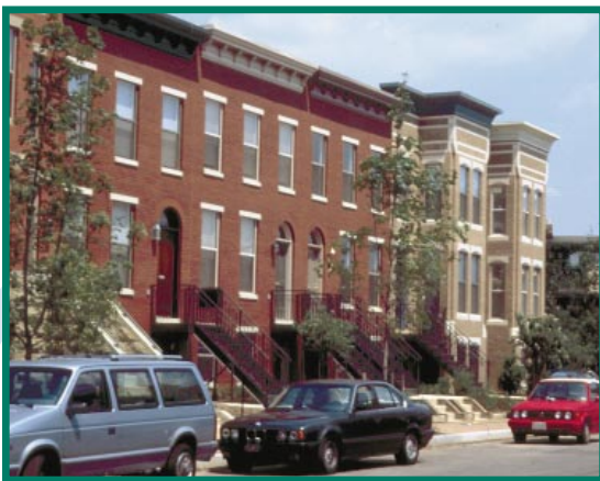
The former Ellen Wilson Dwellings has been rebuilt as a mixed-income cooperative, Washington, D.C.