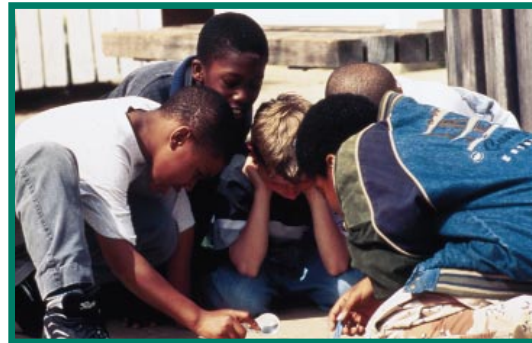
Kids are safe to play and explore in HOPE VI communities

H OPE VI provides a ladder of assistance to residents of distressed public housing, for whom the climb out of dependence to self-sufficiency can be particularly tricky. The stability provided by a quality living environment is invaluable—it gives them a solid foothold from which they can push off with confidence. A diverse, mixed-income community offers them many guides, especially working families whose example can both instruct and inspire.