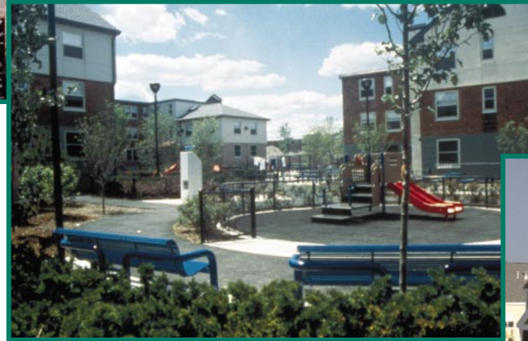
Barren "project" made beautiful, Orchard Park, Boston

HOPE VI-funded redevelopments are sensitive to the needs of their residents and the architectural character of their neighborhoods. Stylistically, HOPE VI developments take their cues from their surroundings. The conventional blank boxes of public housing architecture are being replaced by dignified brick row-houses in Baltimore, Victorian exuberance in Washington, D.C.'s historic Capitol Hill neighbor-