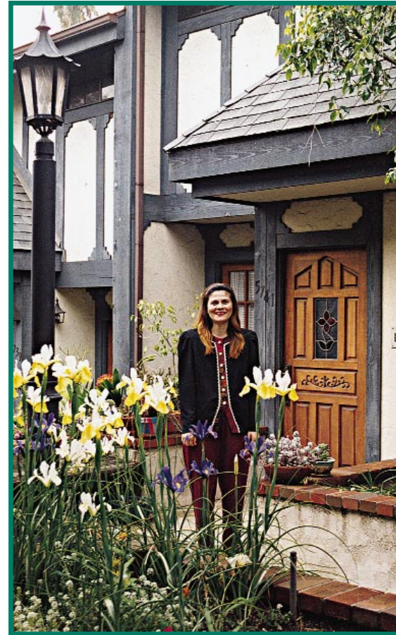
Relocation assistance helped former Pico Aliso residents obtain good housing elsewhere in Los Angeles

In addition, HOPE VI grantees and their partners in the mortgage lending industry bring to bear an array of proven affordable housing financing tools and techniques. By leveraging public and private resources, HOPE VI developments offer lower income buyers lease-purchase arrangements, "soft" second mortgages, reduced downpayment or closing costs, lower interest rates, and other advantages. 🏠