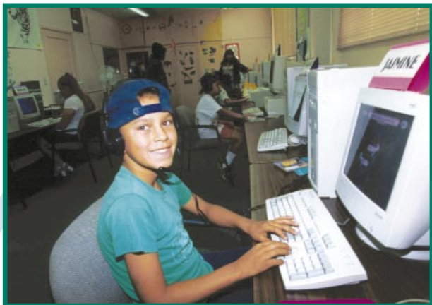
Up-to-date computer learning centers make onsite learning fun

lies as part of HUD’s successful Officer Next Door program.